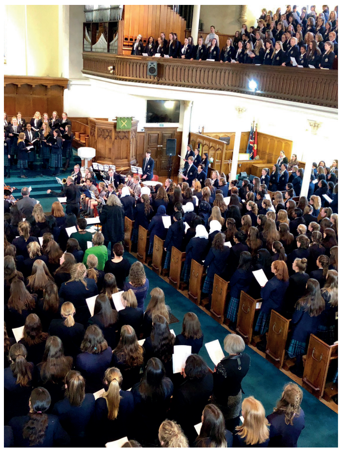
The long standing tradition of the Otago Girls' High School Carol and then Thanksgiving Service is still alive and well at OGHS. In 1994 the name of the event was changed to The Celebration of Family and the Community, but since 1995 it has simply been called Celebration.