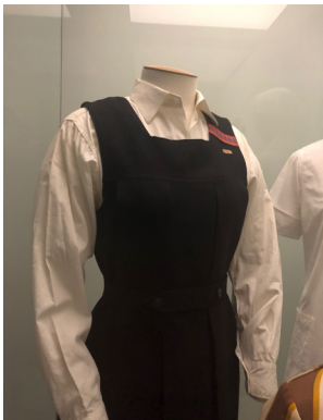
Right: The Otago Girls' High School gym frock also features in the Suffrage 125 exhibition.