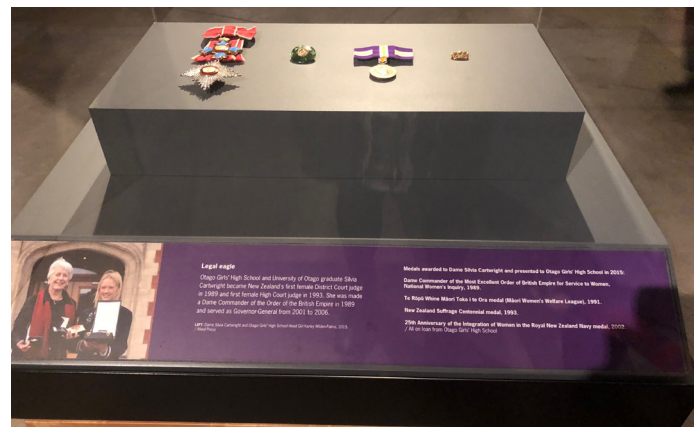
Above: Otago Girls' High School has loaned some of Dame Silvia's medals to Toitū for the exhibition.