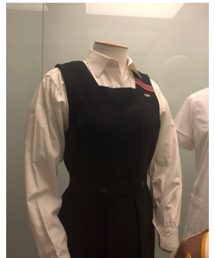
Right: The Otago Girls' High School gym frock also features in the Suffrage I 25 exhibition.