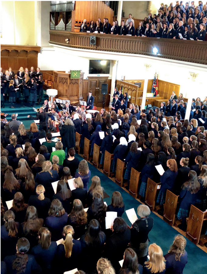
The long standing tradition of the Otago Girls' High School Carol and then Thanksgiving Service is still alive and well at OGHS. In 1994 the name of the event was changed to The Celebration of Family and the Community, but since 1995 it has simply been called Celebration.