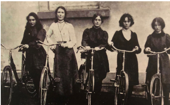
Left: Competitors in the bicycle race at the 1902 school sports.